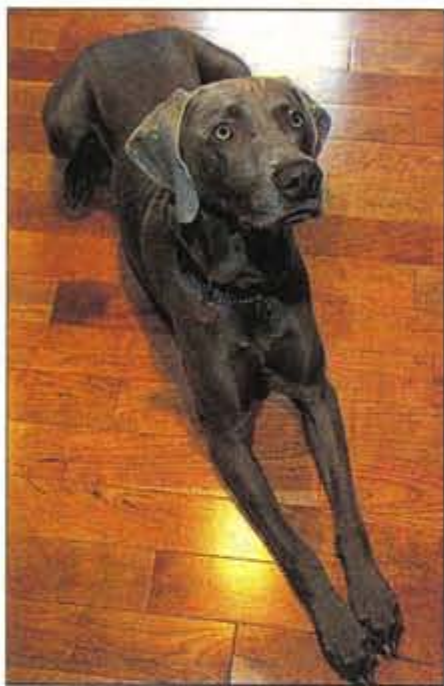
Sampson, the family dog, stretches out on the expanse of hardwood flooring, an American cherry featuring variegated shades from sand to deep umber.