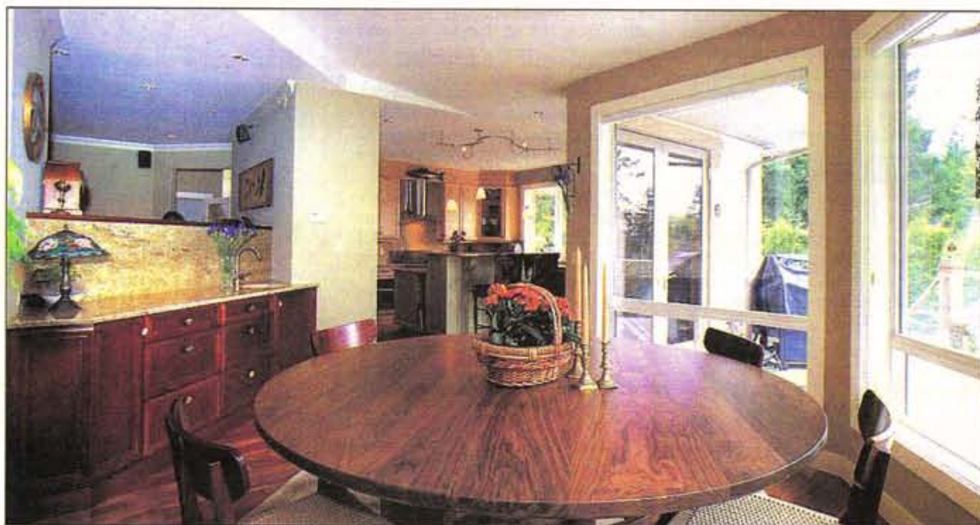
Polished rocks, many with fossils embedded, below, are used as handles on the cabinets in the dining room, above.