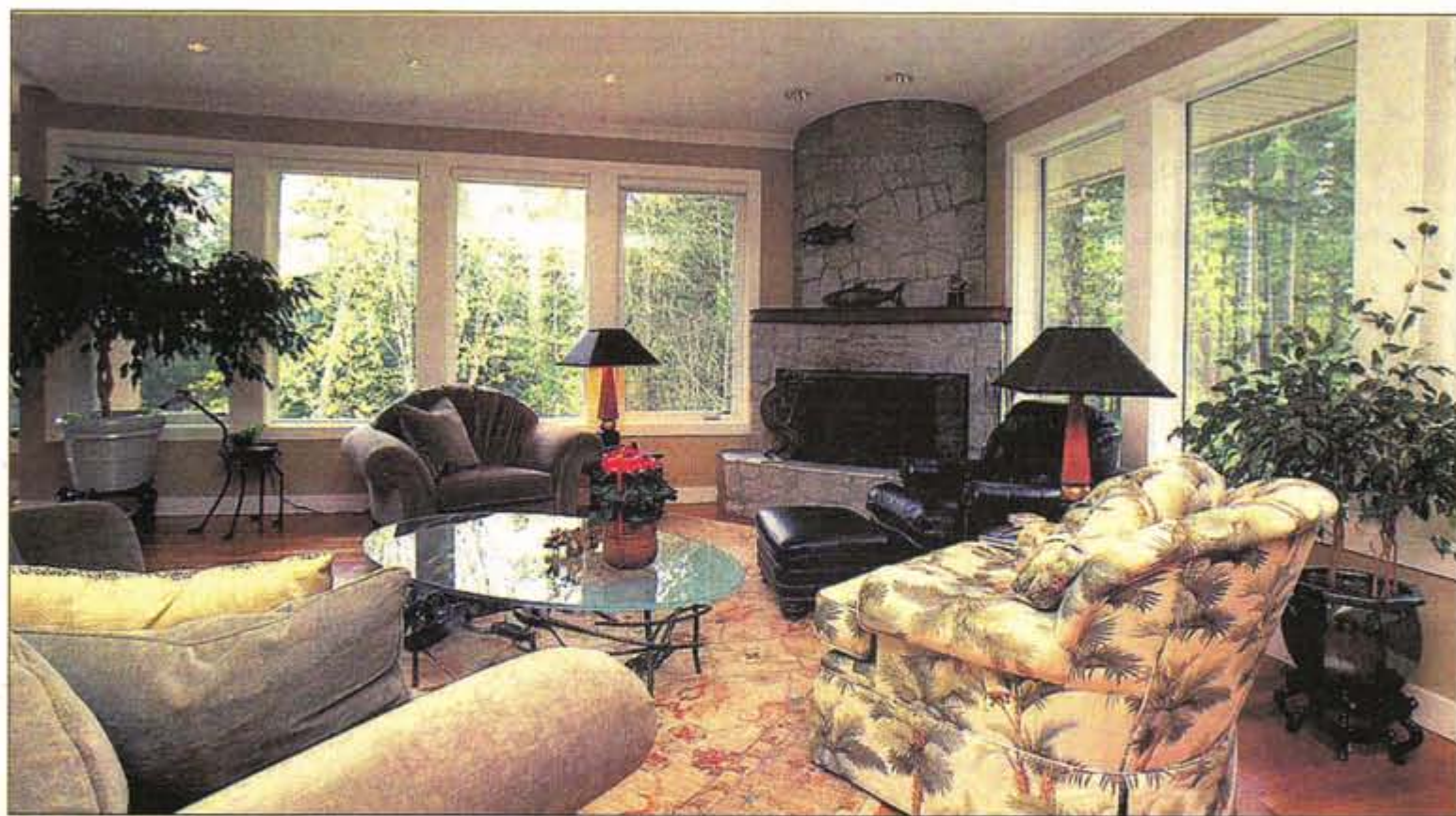
The coffee table in front of the fireplace is actually a work of art by metal sculptor Michael Mintern. Beneath the glass surface, metal fish flit among the wrought-iron fronds and fat floating heads of bull kelp.