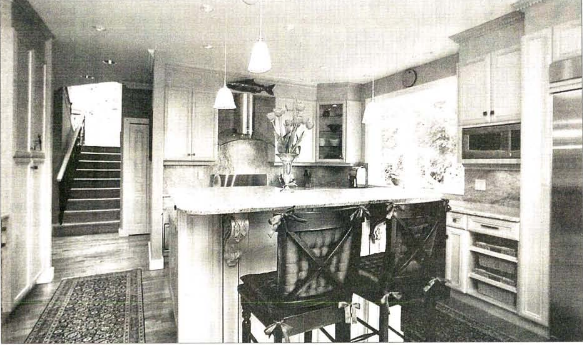
The granite-topped island in the kitchen set the tone for a lot of other colour choices.