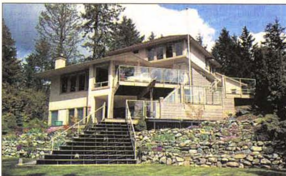
The right angles help draw light into a home, both summer and winter.

Built: 1998 with kitchen renovated 2004. House size: 3,800 square feet with four bedrooms and four baths over three storeys. Property size: 1.8 acres of aged cherry trees amid native plantings. Designer: Donna Riddell at Artistry Design. www.artistrydesign.com